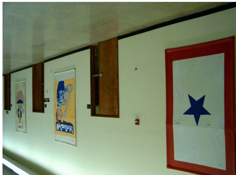
Uncle Sam Wants You, Rosie the Riveter, and Blue Star Banner in the Auxiliary Administration Building lobby

Call the VA office if you can participate in this program.