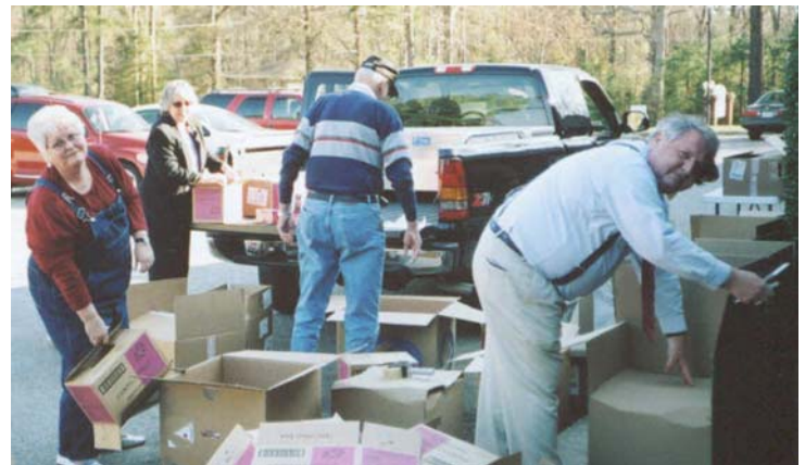
Volunteers packing and wrapping over 1,000 pounds of Girl Scout cookies for shipment to our troops overseas.

If you are able to provide assistance through donation of time or resources, please contact the VA office.