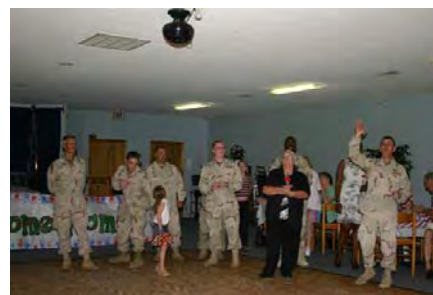
A few of the troops of the 111 th BN

A "Homecoming for Our Heroes" was held at VFW Post 8738, Sunday, June 5, 2005.