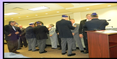
Presentation of the Purple Heart lapel pins to the entire County Council