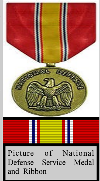
Picture of National Defense Service Medal and Ribbon

The National Defense Service Medal is awarded to anyone who serves on active duty in the United States military during the above time periods. For service in the Gulf War, members of the military reserve (in good standing) or National Guard were initially awarded the NDSM when called to active duty service, but this was later expanded to include all members of the Reserve or National Guard in good standing on the Reserve Active Status List (or equivalent) during the eligibility period. For service in the War on Terrorism, Selected Reserve and National Guard members need only to have been in good standing to receive the NDSM, and no active duty service is required. Inactive Ready Reserve and Retired Reserve are not eligible to be awarded the NDSM unless called to active duty.